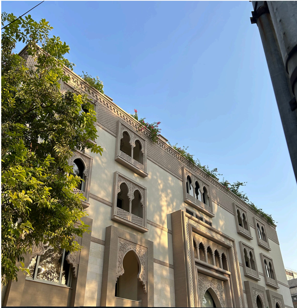
E X T E R I O R