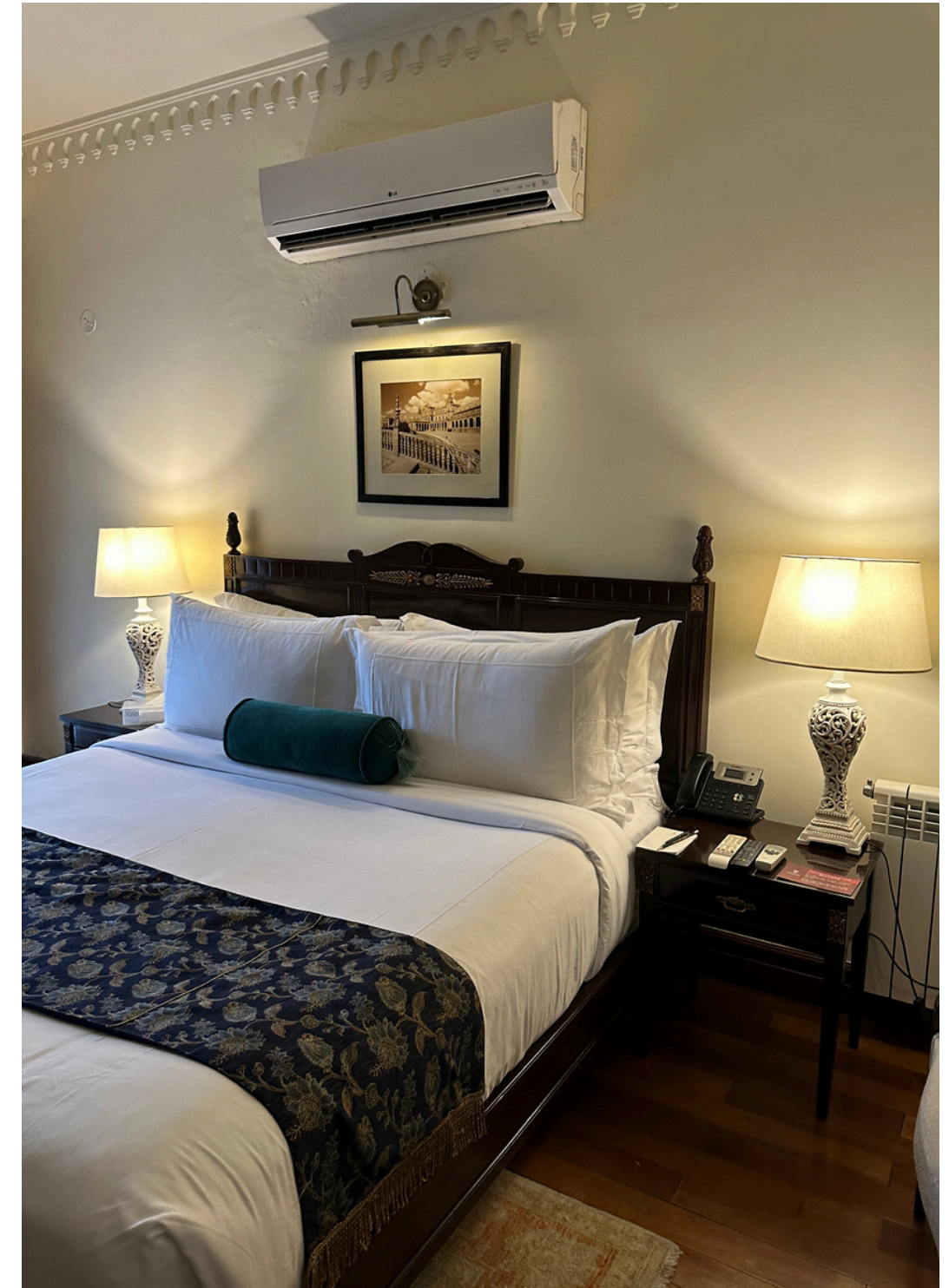
R O O M T O U R