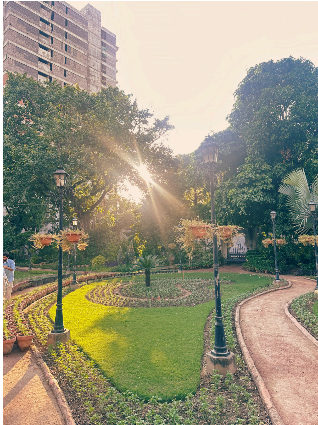
J O I N T P A R K